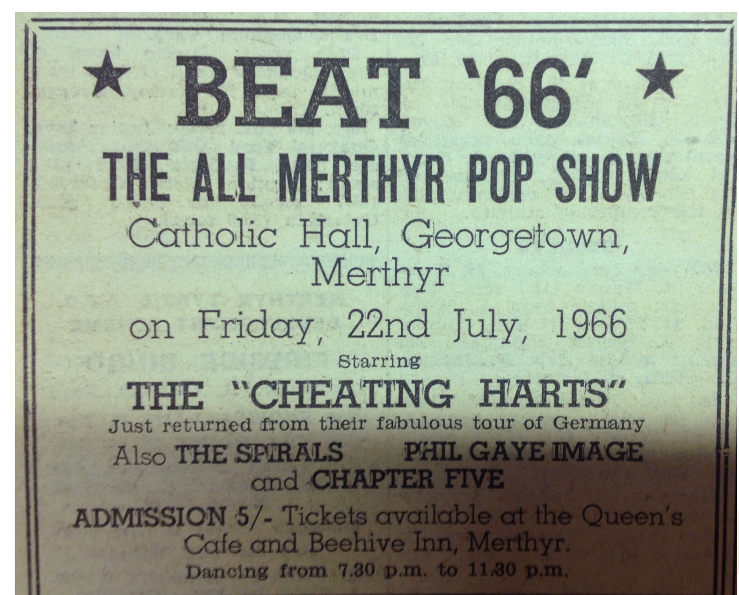
Advert from The Catholic Hall from 1966.

The Catholic Hall, dating from the 1920s, was well known for its dance bands. There was public outcry when the building and land was sold for redevelopment in the 1970s. Today on the former site are the Daffodils and Glan-Yr-Afon nursing homes.