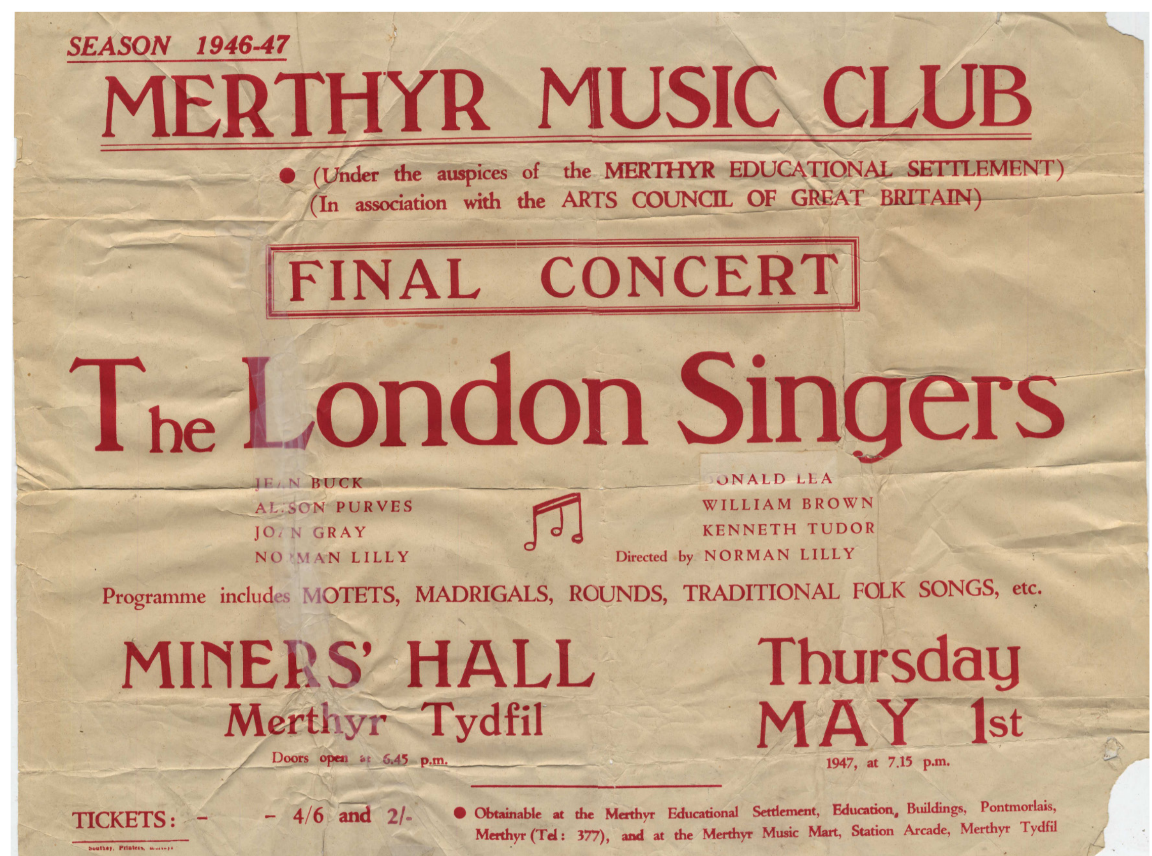
Two Posters from the 1940s.