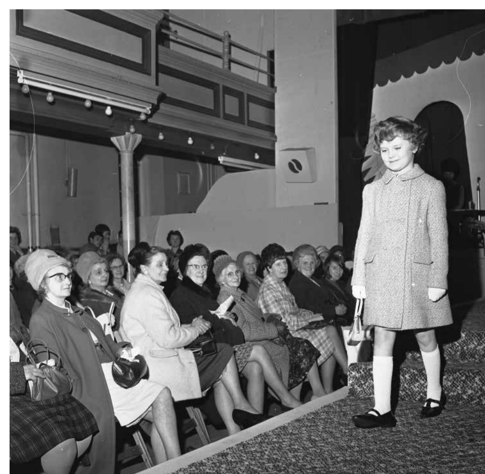
Fashion Week in the 60s.