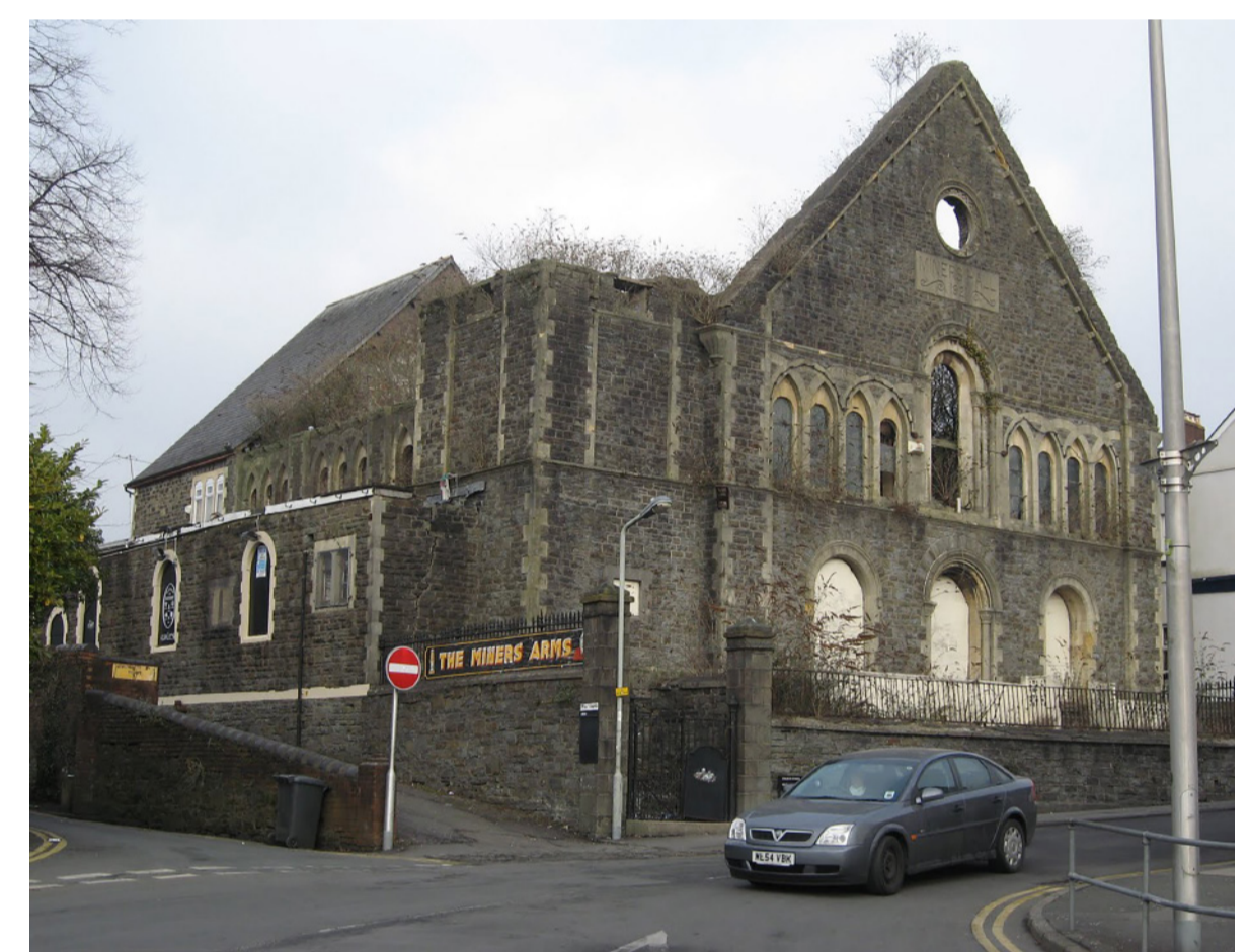
The Minors Hall in Recent Times.